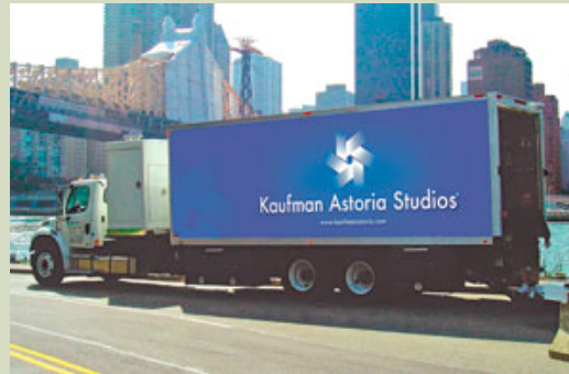
During the filming of "The Bourne Ultimatum"

In the Studio or on location, K/A/S Lighting can satisfy all your project's lighting and grip requirements. From a 12K Par to a stickup light, K/A/S Lighting has the inventory you want, and the dedication to quality and service that are the hallmarks of Kaufman Astoria Studios.